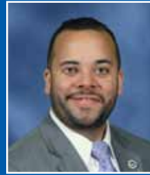
Sen. J.P. Morrell