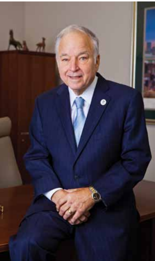
Executive Director from June 1998 through June 2017